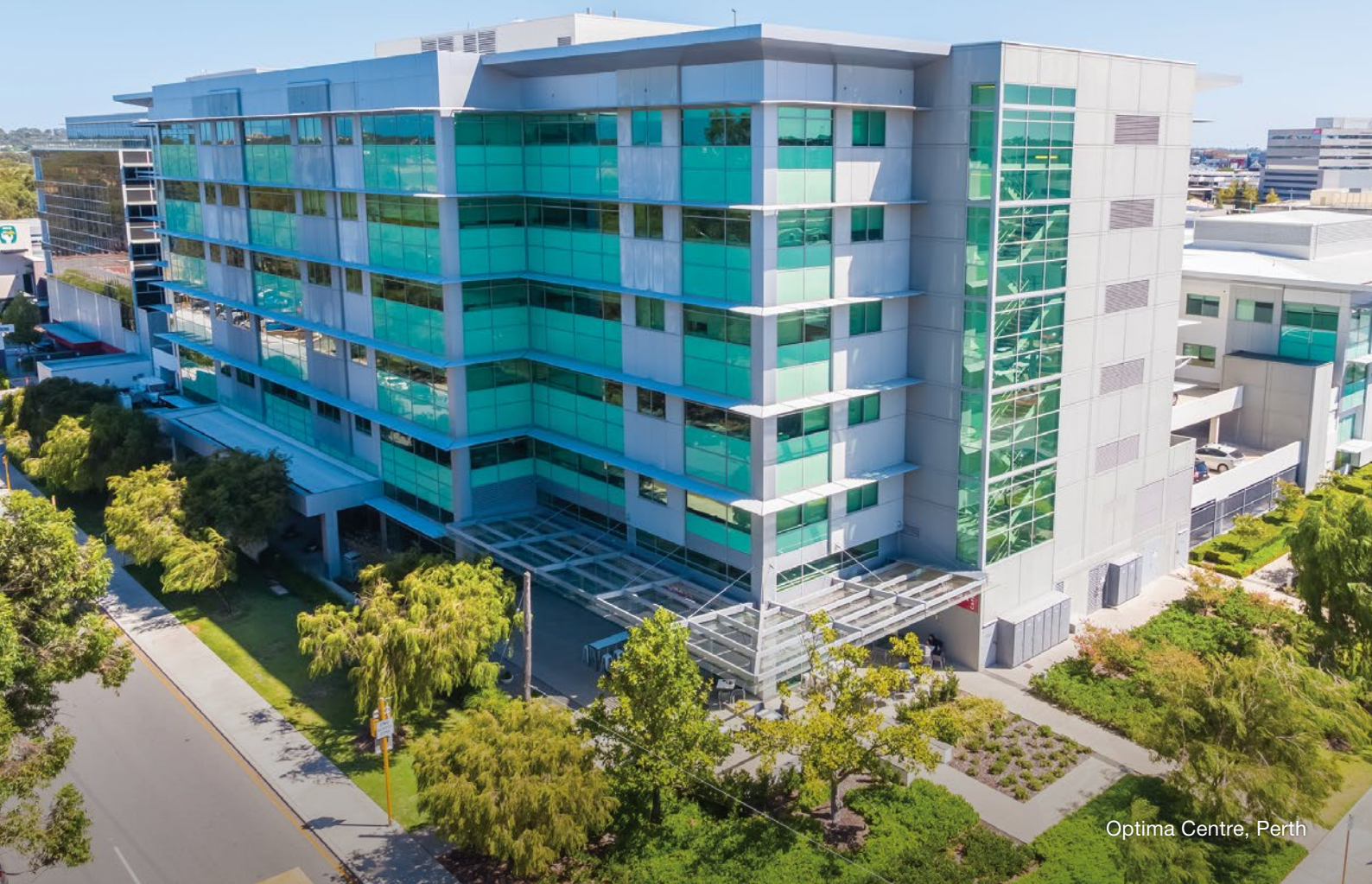
Optima Centre, Perth

Charter Hall WALE Limited (ABN 20 610 772 202, AFSL 486721) as Responsible Entity for Charter Hall Direct Industrial Fund (ARSN 144 613 641) and LWR Finance Trust (ARSN 614 713 138), together comprising Charter Hall Long WALE REIT